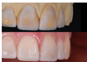
fig.2 Transfere into a precise gypsum work model of the patients mouth