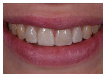
fig.4 Satisfying results